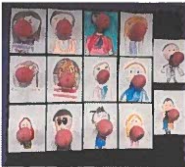
Bubble Gum Art

vided into groups and, with the support of our parent volunteers, continued exploring the gardens, deepening their understanding of living organisms and ecosystems.